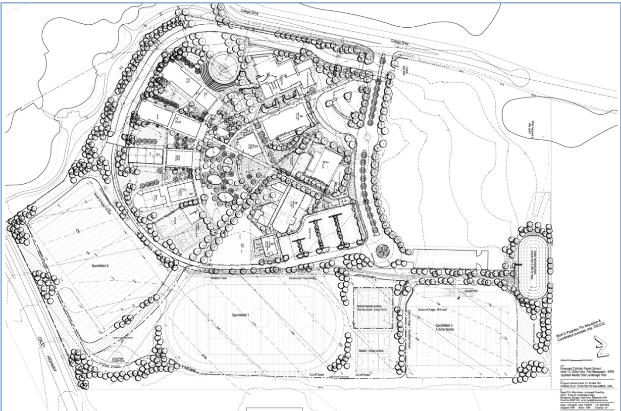
St Josephs Regional College Master Plan.