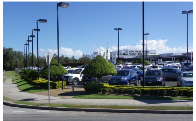
John Oxley Motors.