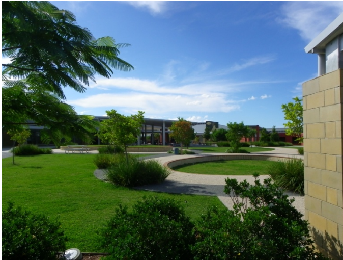
St Josephs Regional College: 'year areas'.