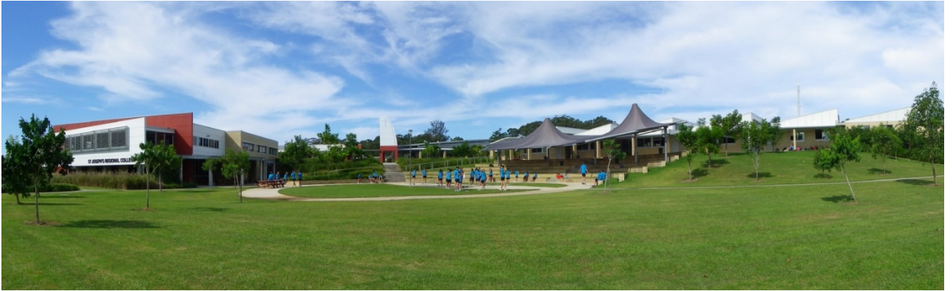
St Joseph's Regional College: amphitheatre.